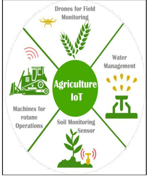
Figure. 1 IoT in agriculture

In parallel, food companies are looking for ways to meet consumer demand for better food quality and sustainability. IBM's solution will bridge food companies and their grower suppliers to better manage the inputs and farming practices that can deliver on the promise of improved food quality. IBM is drawing on its experience with improving products ranging from wine to tomatoes to make this vision a reality.